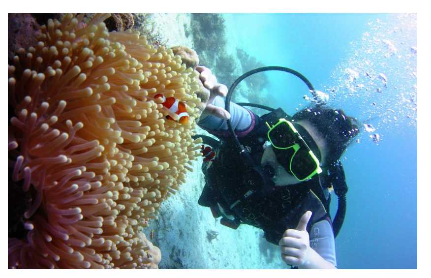
"With the support and coaching that I get, I am able to do better. My growth is continuous."