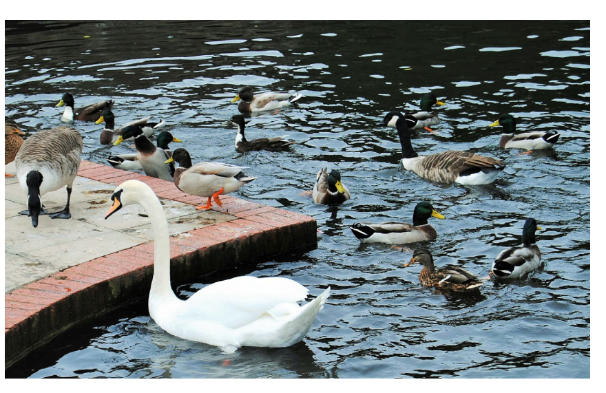
"I like being recognized and respected for my unique perspective. I am free to be authentic."

Photo: Angel Lubugan Audit and Assurance