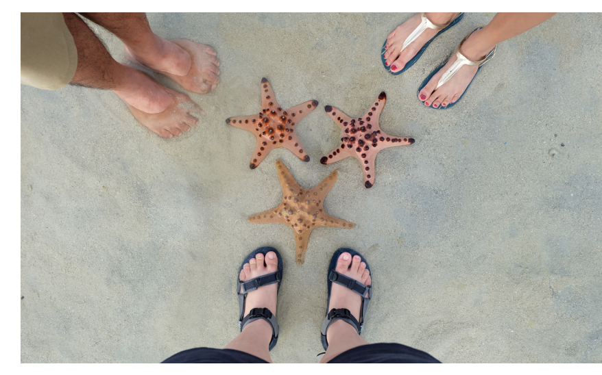
"We enjoy learning about other people and applying that learning in our work. We are better together!"

Tax Advisory and Compliance