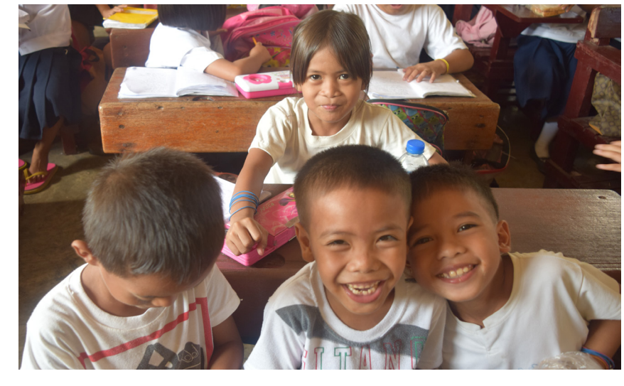
"I like that I am able to contribute to the community, to the upliftment of the people who matters most, the children. I am inspired to make a difference."